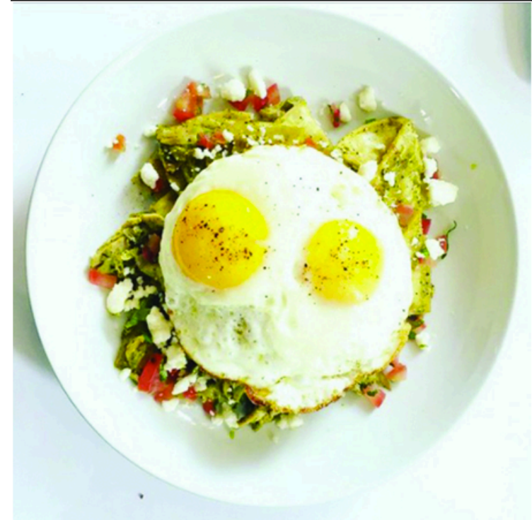
208 Rodeo, Beverly Hills Open everyday 9AM - 10PM

208 Rodeo lies at the top of the Spanish Steps on Rodeo Drive, one of the most iconic emblems of the Beverly Hills neighborhood and Los Angeles as a whole. With views of palm trees and pedestrians, the restaurant is the perfect place to grab brunch on a Sunday morning, and that's just what we did. With a new and improved breakfast menu to test, we were treated to fresh and local ingredients, and a warm and welcoming ambience on the unusually rainy LA morning. A clean modernist look paired with standout service makes for an even better meal. Food standouts included the Crab Cake Benedict, Moroccan Skillet and the 208 Rancheros. To drink, the Cafe Royal morning cocktail and blended Limonana were the perfect way to start the day.